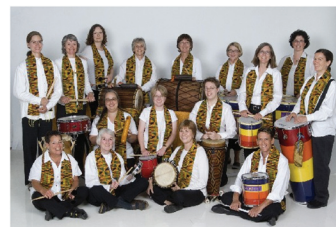
Ethnic drumming performance by DrumHeart